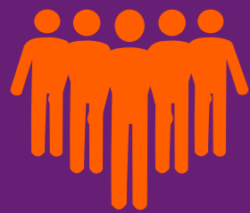
Blue Collar Workers

Customize your covers and benefit limits to fit your company's requirement.