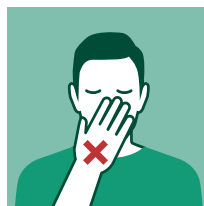
Avoid touching eyes, nose and mouth