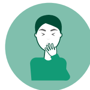
Weakened immune systems