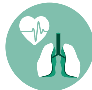
Heart & lung disease patients