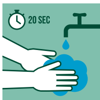
Wash hands with soap